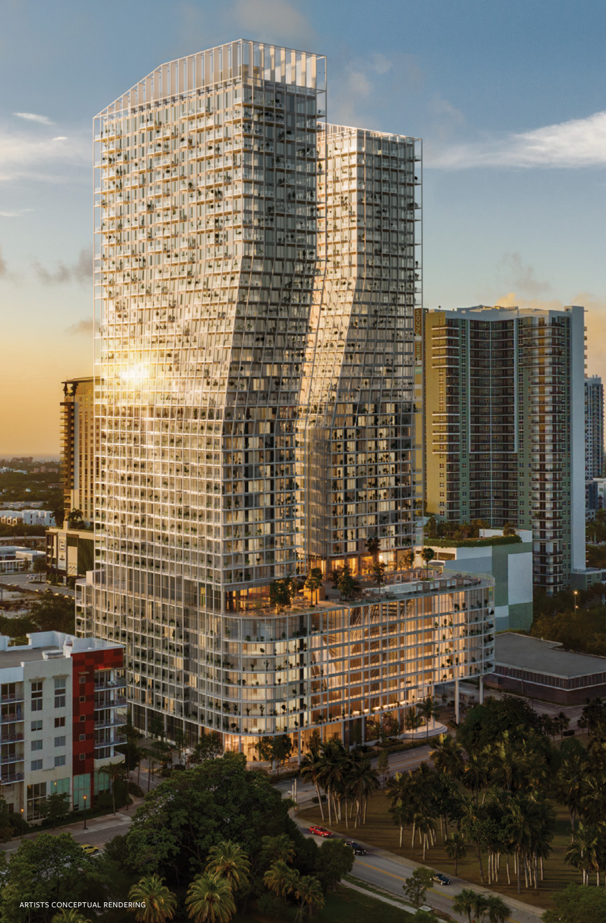
ARTISTS CONCEPTUAL RENDERING