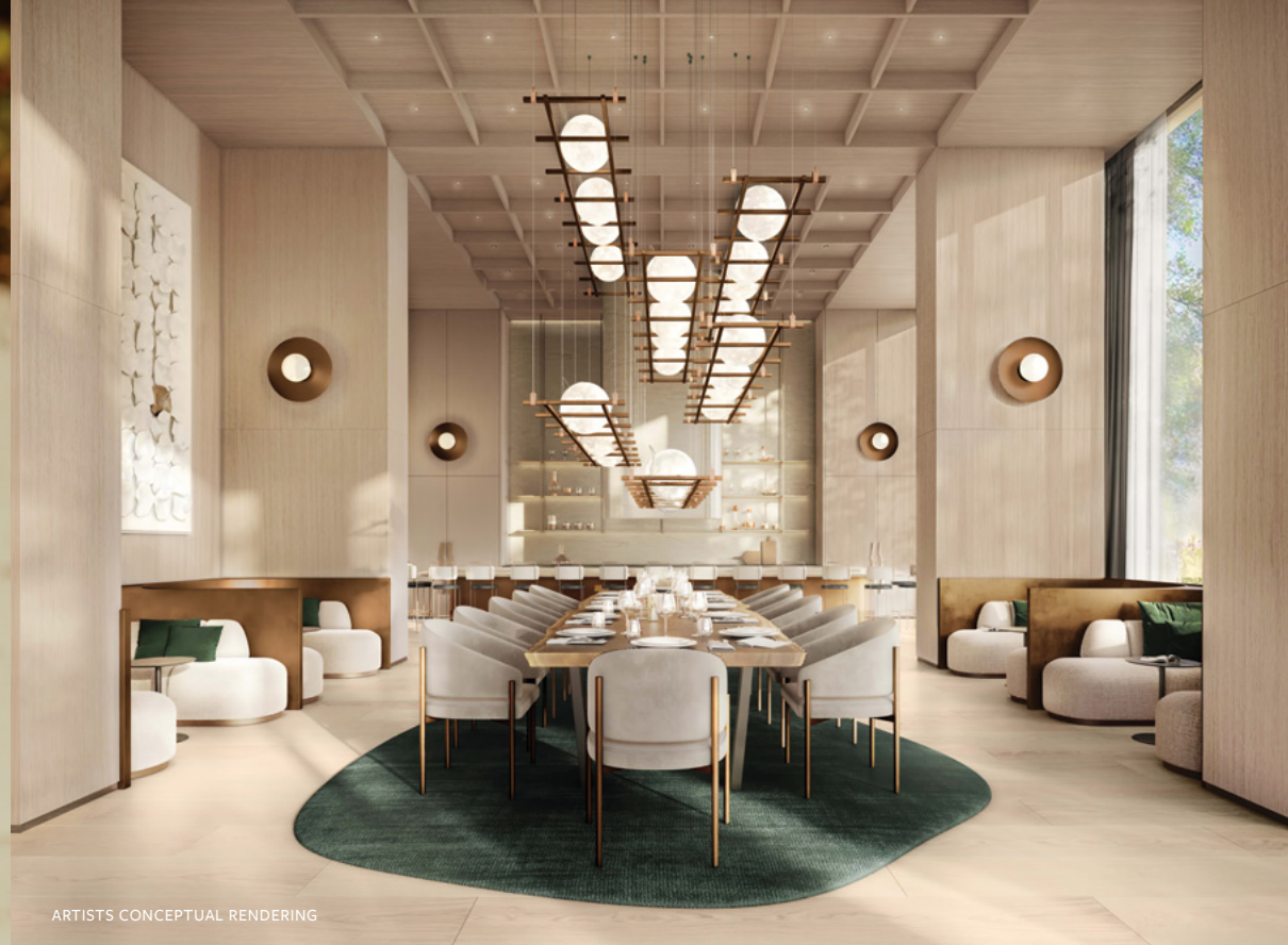
ARTISTS' CONCEPTUAL RENDERING

WHERE PEOPLE AND IDEAS COME TOGETHER TO CO-CREATE A DANCE OF CITY LIFE, THE NATURAL ENVIRONMENT, AND AN ELEVATED SIGNATURE OF TIMELESS BEAUTY.