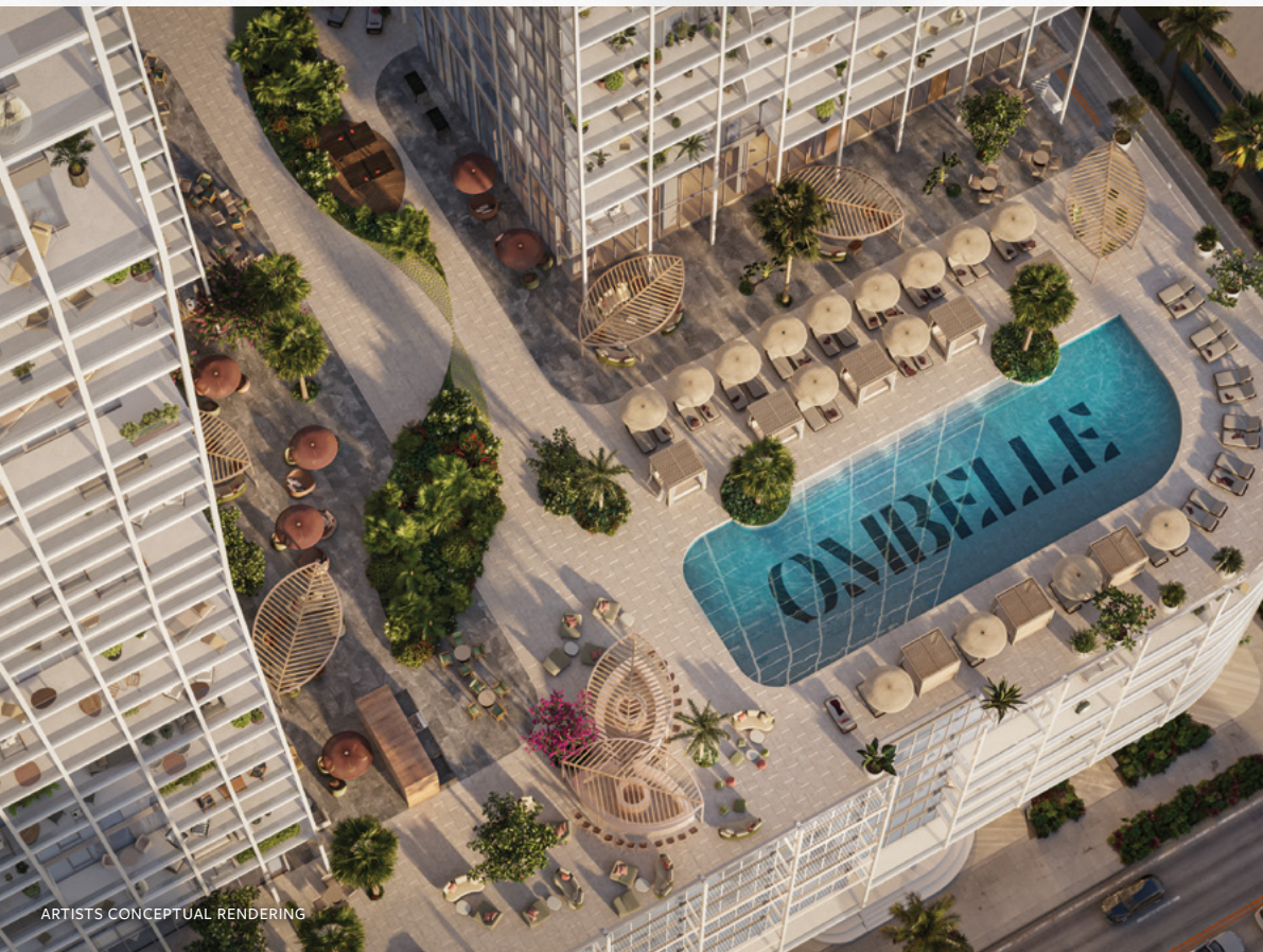
ARTISTS CONCEPTUAL RENDERING

Exclusive wellness and fitness spaces are thoughtfully tailored to enhance everyday living; with opportunities to recharge, refresh, and thrive in an active community focused on self-care for the body, mind, and soul.