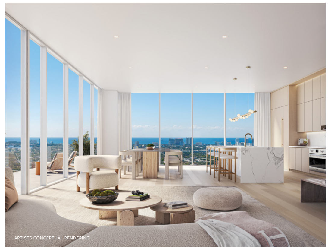
ARTISTS CONCEPTUAL RENDERING

With a community plaza for everyday conveniences and 100,000 SF of limitless amenity space exclusive to residents, Ombelle offers a lifestyle unlike anything yet to be imagined in Fort Lauderdale.