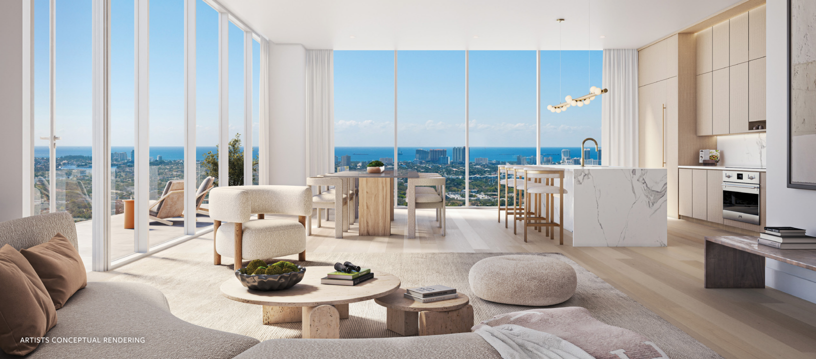
ARTISTS' CONCEPTUAL RENDERING