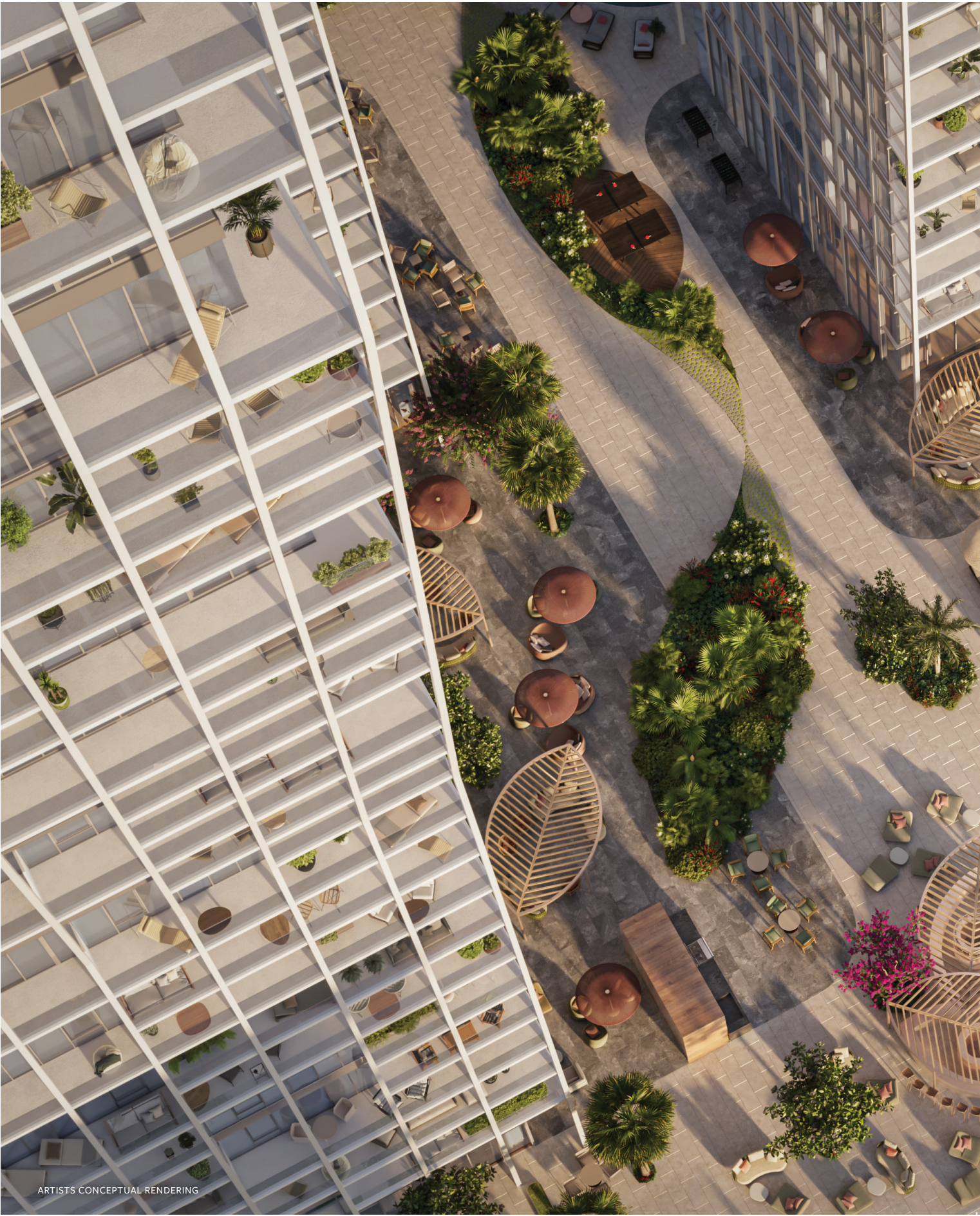
ARTISTS CONCEPTUAL RENDERING